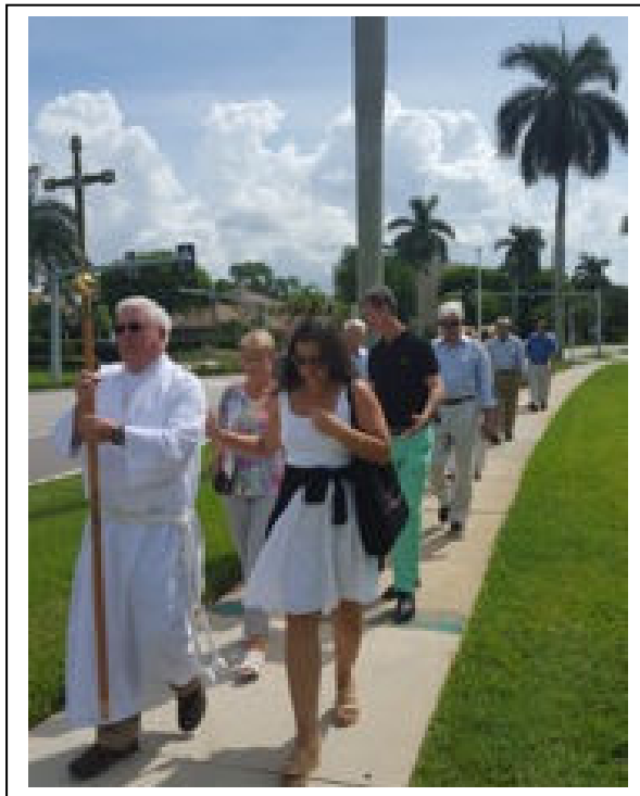
St. John's members joined believers around the nation in a repentance and prayer walk on Sunday, September 13, ending the year of Shemitah, a time of rest.

October 22 - Kids Connection. Calling all at-home moms/dads and children for Kids Connection. This is a great opportunity for kids to connect with parents and parents with parents as we have fun reading stories, playing games, singing songs and more. 9:30 to 10:30 a.m.